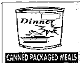
CANNED PACKAGED MEALS

PASTA, POTATOES, RICE LAST SEEN HIDING IN THE AISLES!